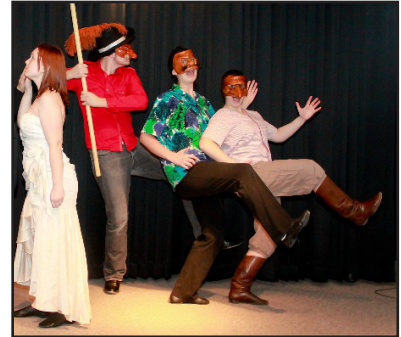
Members of the Panini Players